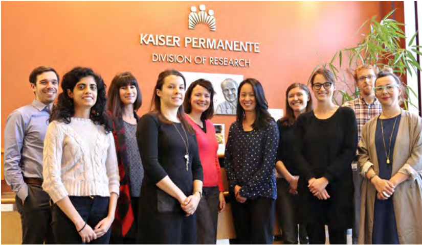
In 2018, the Division of Research was home to 11 postdoctoral researchers and fellows (10 shown).

Each year, as we transition from one year to the next, we have the opportunity to look back at the important initiatives in which the Division of Research played a part. And in 2018, the Division was instrumental in a number of significant changes that allow us to advance our core mission of delivering research that both informs and improves health care.